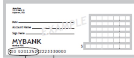
Routing Number Account Number 9 digits